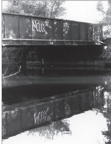
Graffiti offenders risk injury by placing graffiti on places such as this railroad bridge spanning a river.