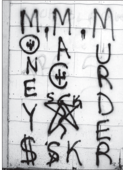
Gang graffiti marks territory and conveys threats.

In areas where graffiti is prevalent, gang and tagger graffiti are the most common types found. While other forms of graffiti may be troublesome, they typically are not as widespread. The proportion of graffiti attributable to differing motives varies widely from one jurisdiction to another. § The major types of graffiti are discussed later.