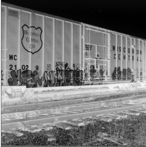
Graffiti is commonly found in transportation systems, such as on the side of this railroad car.

§Most sources suggest that paint-over colors should closely match, rather than contrast with, the base. Contrasting paint-overs are presumed to attract or challenge graffiti offenders to repaint their graffiti; the painted-over area provides a canvass to frame new graffiti.