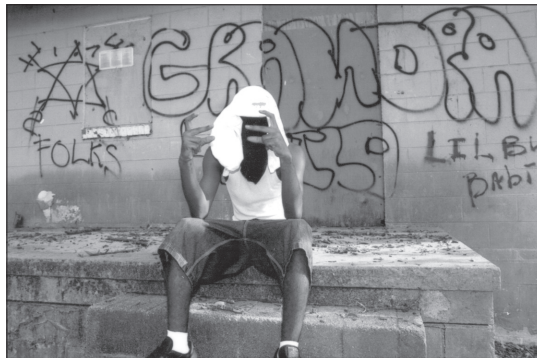
Young male gang members may engage in a substantial amount of graffiti.