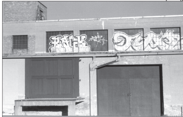
Graffiti often appears in hard-to-reach yet highly visible locations, such as on the upper-story windows of this warehouse.