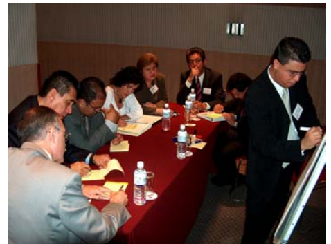
Mediation Center Design, Management and Operations workshop. Distrito Federal, may 2004

Prior to initiating the Project there were three court-annexed mediation centers in Mexico. Today, 18 court-annexed centers are fully operational. Mediators from all 18 centers have been trained by the Project.